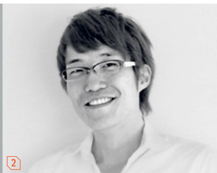
Oki Sato for Minotti

product Ring standout A family of elegant occasional tables from the Nendo founder contrasts straight lines with circles—the latter evident in the Calacatta marble top and the light-bronze-finish brass base's integral loop. minottiny.com