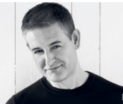
Mario Ruiz for Punt

product Malmö standout Super-matte walnut envelops the Spaniard's cabinet, perched atop ultra-thin lacquered-steel legs; for added oomph, spec anodized-aluminum front and top panels in gold, bronze, or pale-rose finish mimicking precious metals. puntmables.com